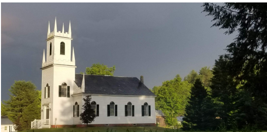
Christ Church Guilford on Melendy Hill Road in Algiers Village, Guilford, Vermont

https://www.christchurchguilfordsociety.org/contact-us/ .